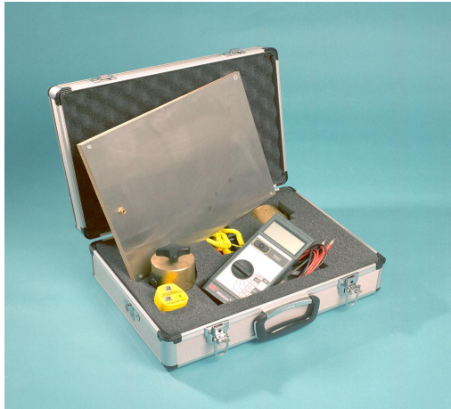
The Model EFF10 Flooring & Footwear Test Kit - an essential test instrument for electrostatic hazard control

For industrial situations and areas where sensitive flammable atmospheres may be present due to flammable gases, vapours and fine dust clouds, it is necessary to adopt the correct antistatic precautions. In many incidents of industrial fires and explosions caused by static electricity, charge accumulation on plant operators has been determined to be the cause.